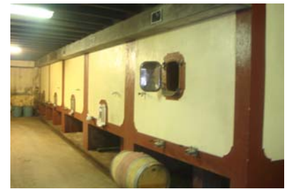
Chateau Bibian Cuvier