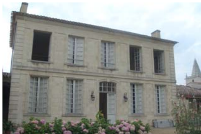
Chateau Bibian in Listrac

FOOD PAIRING Braised Swiss Chard with Cannellini Beans, topped with Aged New York Steak. Red meats with sauce, game. Large variety of cheeses.