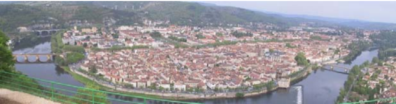
The town of Cahors and the Lot river in Southwest France