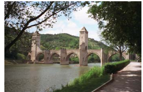
The Lot river in Cahors

MALBEC One of the five grapes allowed in the Bordeaux blends, Malbec was once a significant Bordeaux grape, but in that region it has taken a back seat to Merlot and