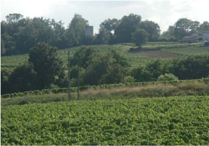
Vineyards around Cadillac's Hill