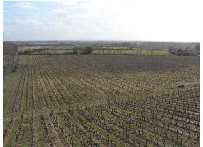
The bottom of the property with the Dordogne River in the background