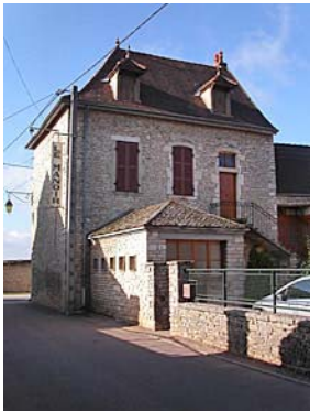
Manoir Murisaltien in Meursault