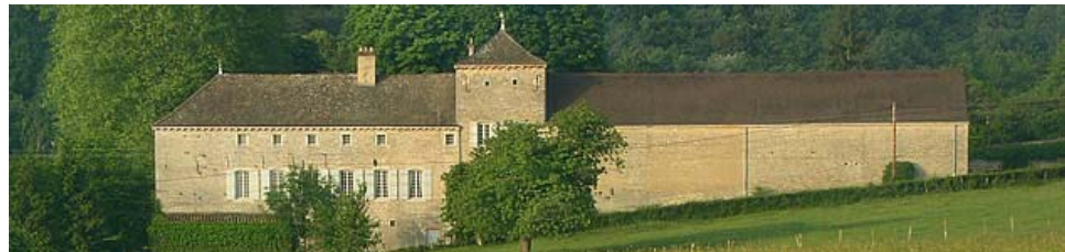
Chateau de Messey in Macon