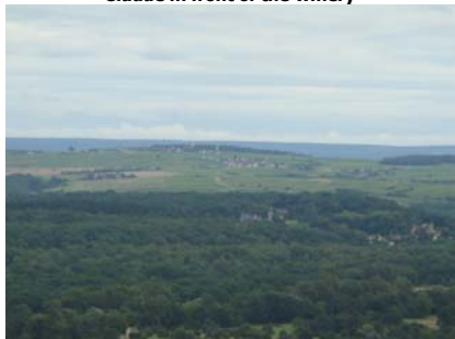
View of the Pouilly-Fume vineyards from the hill of Sancerre, 8 miles west.