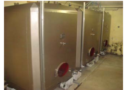
Cuve de Fermentation / Fermentation Tank