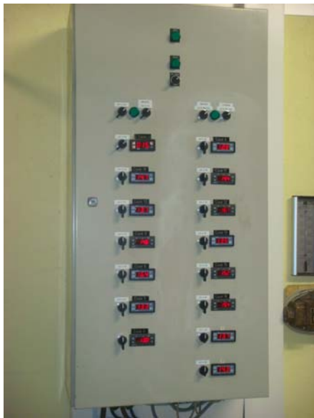
Temperature Control System