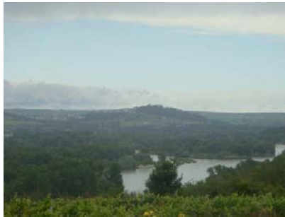
View of Sancerre from Pouilly-Fume