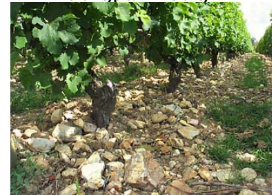
More Silex (arrowheads)