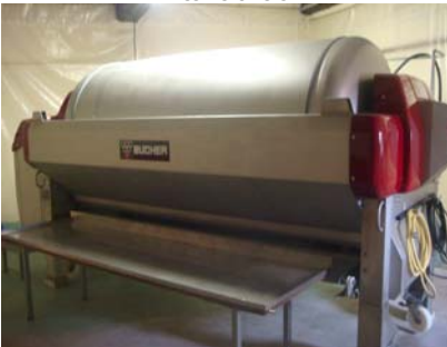
Pressoir Pneumatique / Pneumatic Press