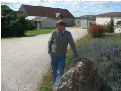
Claude in front of the winery