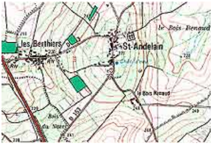
Map of Saint-Andelain

FOOD PAIRING This wine is highly versatile and can be enjoyed with an entire range of foods: light Hors d'oeuvres, grilled fish, cajun food, poultry, ham, sweetbreads, pieds de cochons (pigs feet), pasta, sushi goat cheese, mild cheese in general.