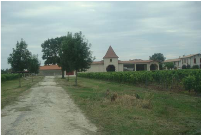
The Winery (on the left) and the owners' House (on the right)