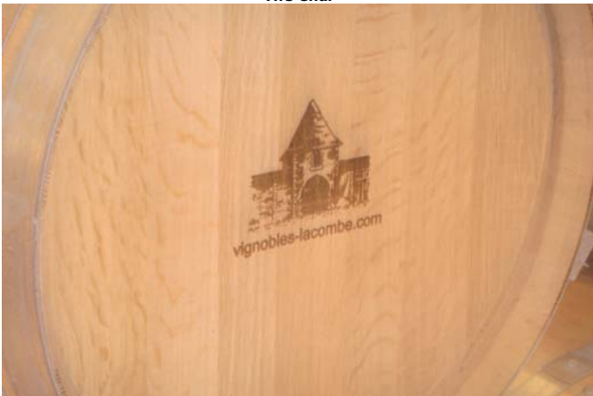
Lagravette-Lacombe wines are aged 18 months in French oak, 25% new