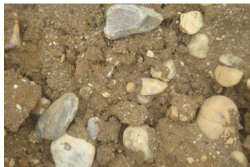
Lagravette Terroir : Medoc gravel

New York Steak with Potato Leek Gratin, Baby Carrots Bordelaise Sauce