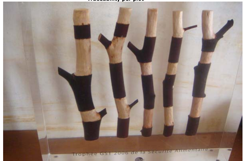
Food Safety GST 2006 Award