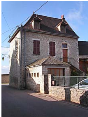
Manoir Murisaltien in Meursault