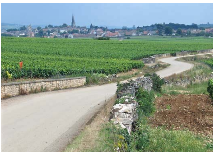
The village of Meursault in the background