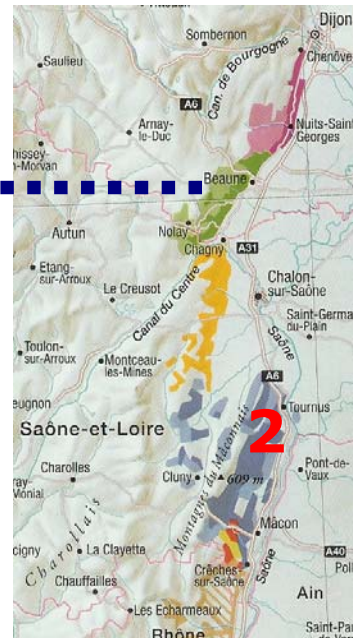
General map of BURGUNDY