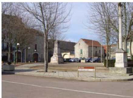
Center of Town