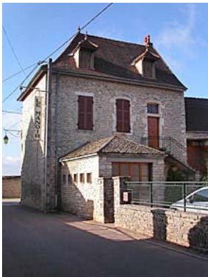
Manoir Murisaltien in Meursault