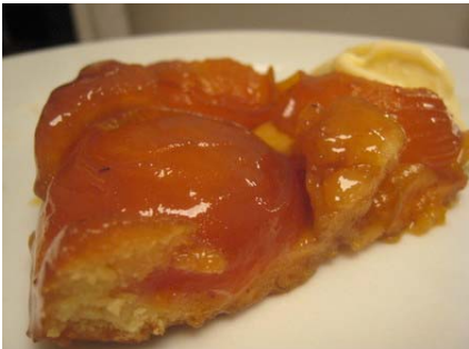
Tarte Tatin, made with apples but even apricots, is a typical pairing with Chateau La Grave 98'

Can accompany a wide range of dishes (Foie gras, Roquefort, as an aperitif or with dessert) and is also a joy to savor with a good cigar