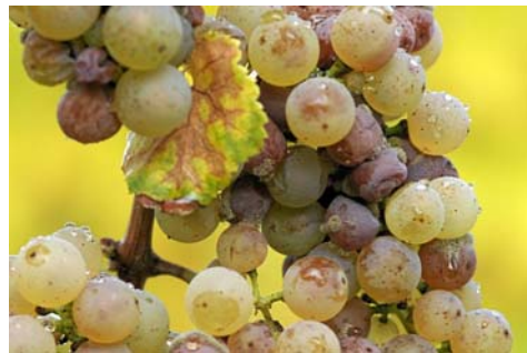
The presence of botrytis cinerea , the "noble rot", concentrates the must of the grapes, which are picked by hand late in the harvest season and in several stages.