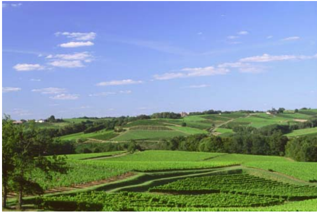
Chateau La Grave Vineyards 1