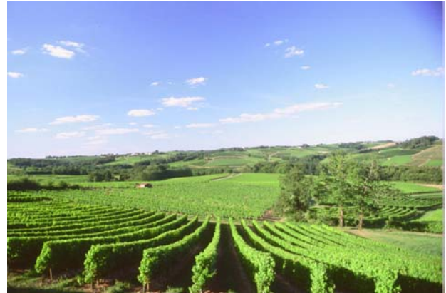
Chateau La Grave Vineyards 2