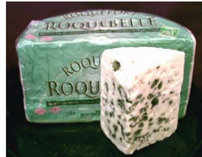
Legally, Roquefort can only be made in the town of Roquefort (South West of France). AOC since 1925...