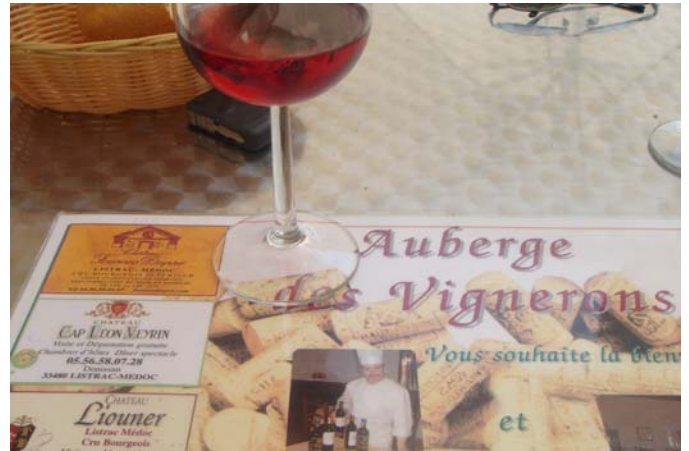
L'Auberge des Vignerons, the only restaurant in the hamlet of Listrac, features the Cap Leon Veyrin wine