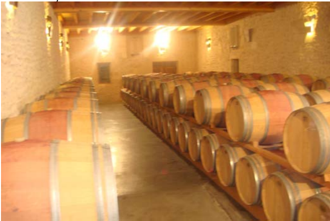
Chateau Bibian Cellar