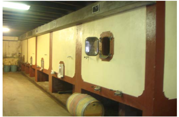
Chateau Bibian Cuverie