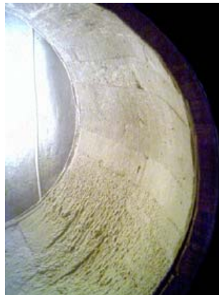
The Lies give body and structure to the wine.