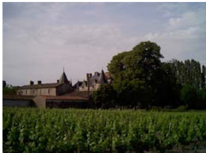
The Chateau de la Preuille is around the estate itself.