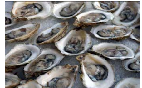
Oysters make one of the best pairing with Muscadet.

Hugh Johnson, famous wine writer, calls Muscadet "Neptune's own vineyard"