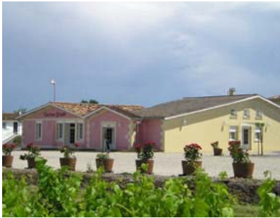
The winery of Chateau Sorbey

Haut-Medoc is the grand classic AOC of Bordeaux, with full-bodied, masculine and brilliant wines.