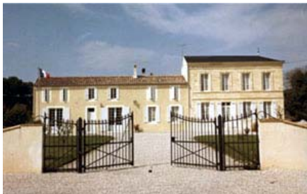
Chateau Cap Leon Veyrin in Listrac

TASTING NOTES In advance, the charming ruby red color of this wine reveals the elegant nature of its aromas. Then, smoky notes mingle with honey, flowers and juicy red fruit. On the palate, the ripe fruit elements extend to cherry and black plum notes, ending with a hint of eucalyptus which lifts the wines and makes it appealingly fresh. The 2005 is this wine's best vintage to date and was an exceptional vintage throughout the Medoc.