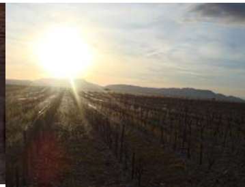
The sun rises on the famed Dentelles de Montmirail