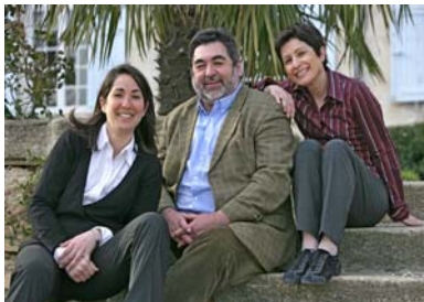
The Bernard family

TASTING NOTES Aromas of delicate white flowers . Medium-bodied thanks to the texture given by the Grenache blanc, this wine is bright on the palate, with fresh pear and citrus flavors (coming from the Viognier grape) framed by the clean, refreshing acidity of the Clairette.