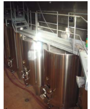
Fermentation parcellaire in the Cuverie